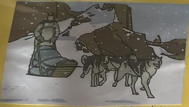
First Robert Falcon Scott and his crew and the dogs set off on his journey.