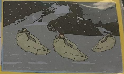
Then there they have a break